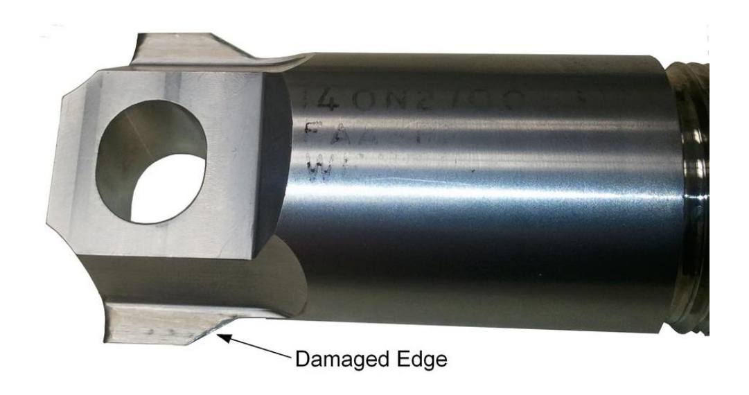
Figure 1, Wencor Center Shaft with Damaged Edge

During installation of the Wencor Center Shaft PN 140N2700-5WA, a single customer discovered that an edge was slightly damaged as shown in Figure 1 below, and the damage prevented proper assembly into the NHA.